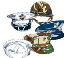
Veterans Recognition Day